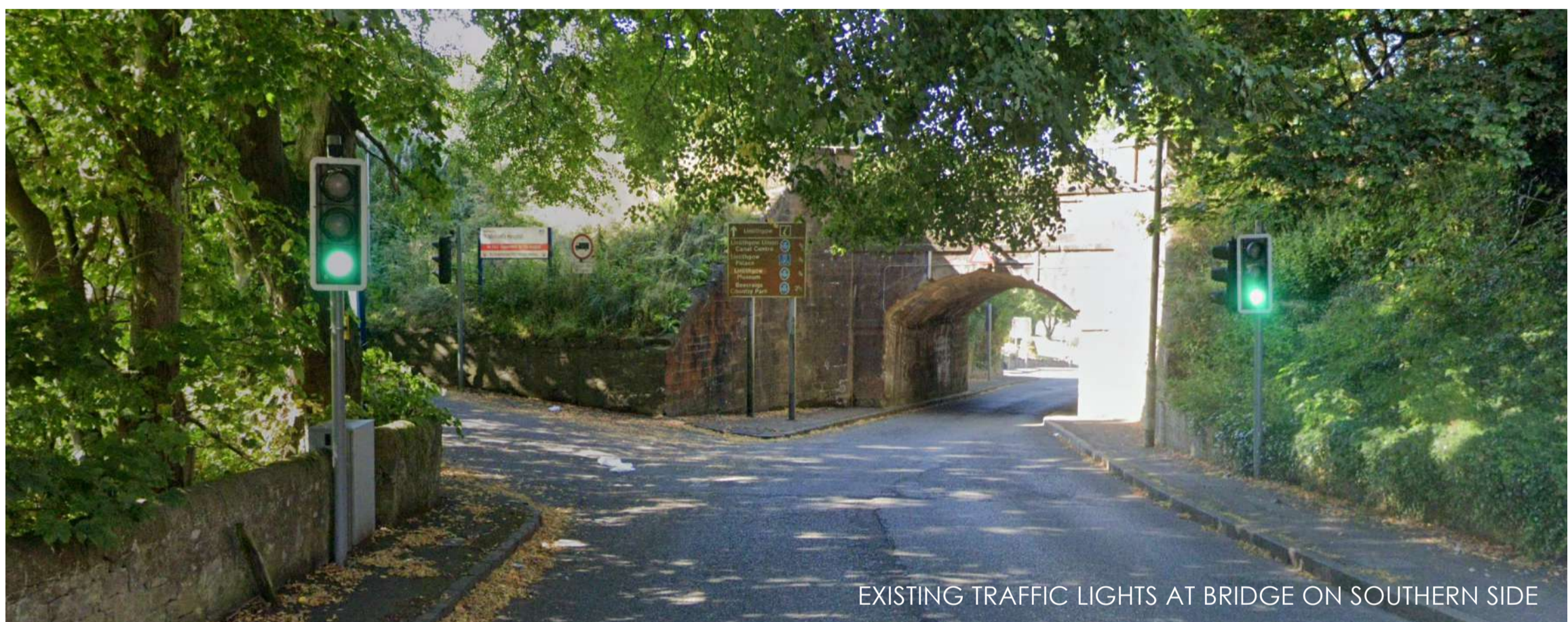
EXISTING TRAFFIC LIGHTS AT BRIDGE ON SOUTHERN SIDE