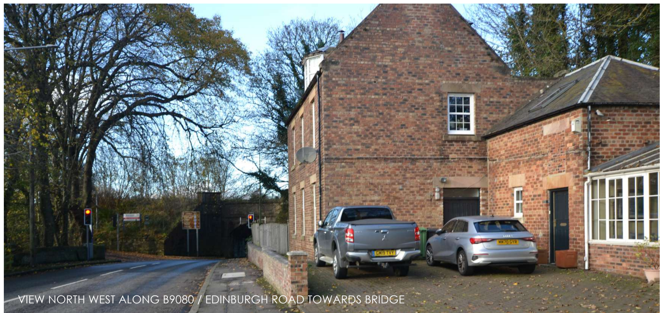
VIEW NORTH WEST ALONG B9080 / EDINBURGH ROAD TOWARDS BRIDGE