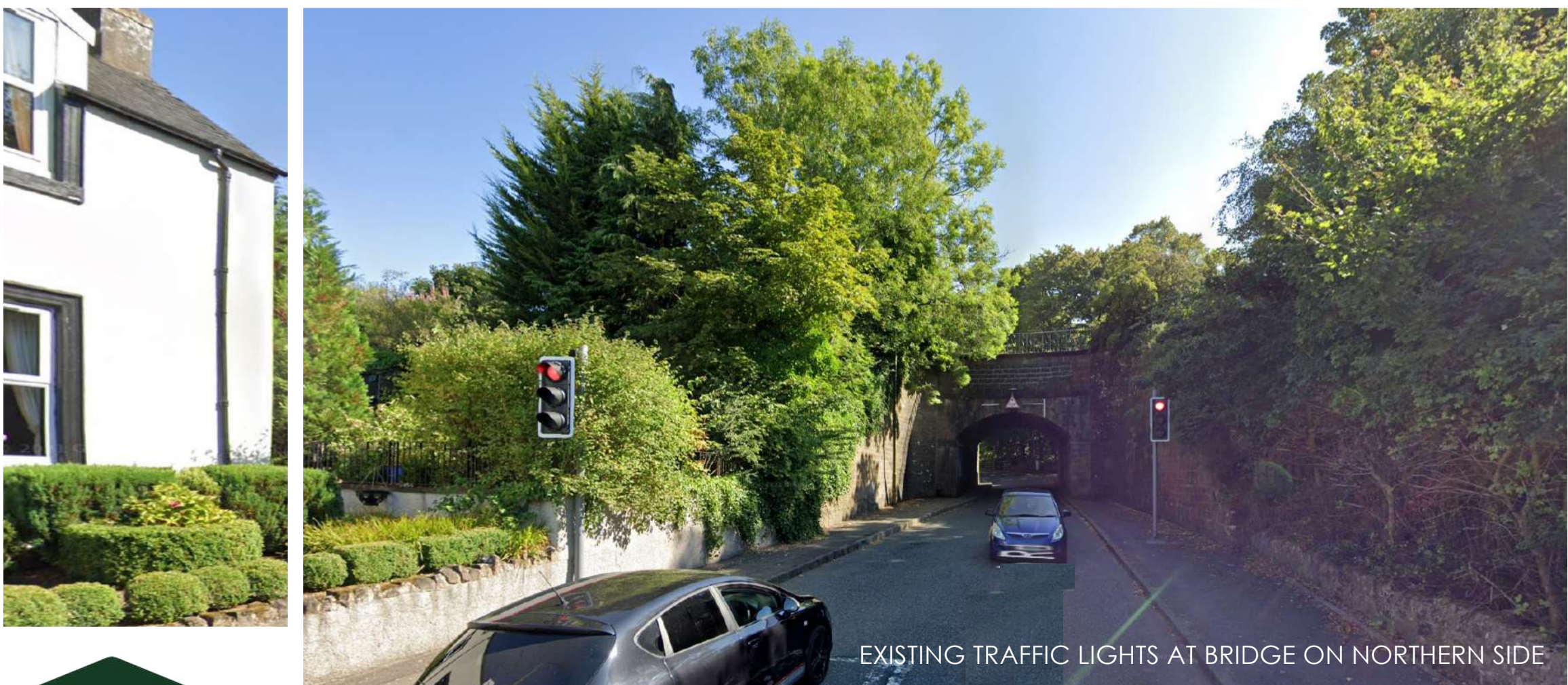
EXISTING TRAFFIC LIGHTS AT BRIDGE ON NORTHERN SIDE