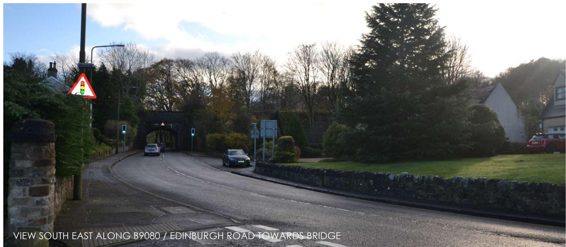
VIEW SOUTH EAST ALONG B9080 / EDINBURGH ROAD TOWARDS BRIDGE